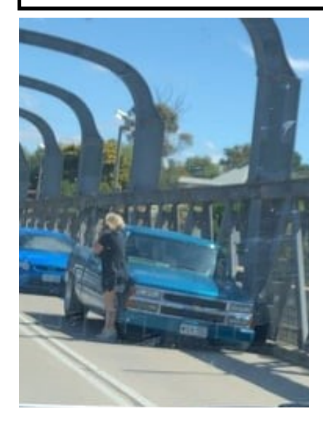
Below: A bit loose on the crank

With this in mind, Use & load your vehicles.... but please use them for the right thing.