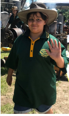
Power of the past 2022, our Junior members