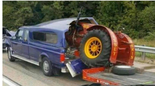
From one extreme to the other